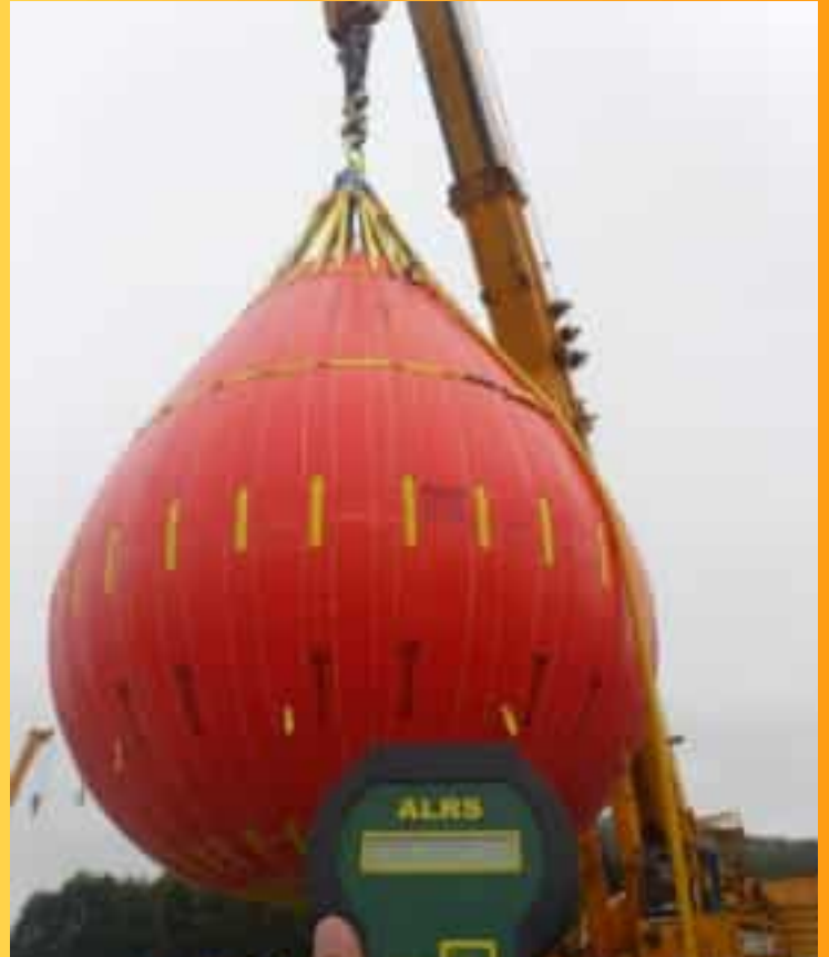
Full Capacity: 110 Metric Tonne