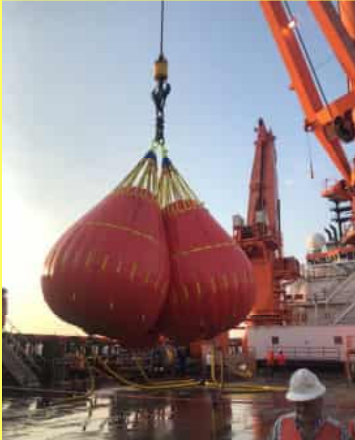
200 Tonne Load Test