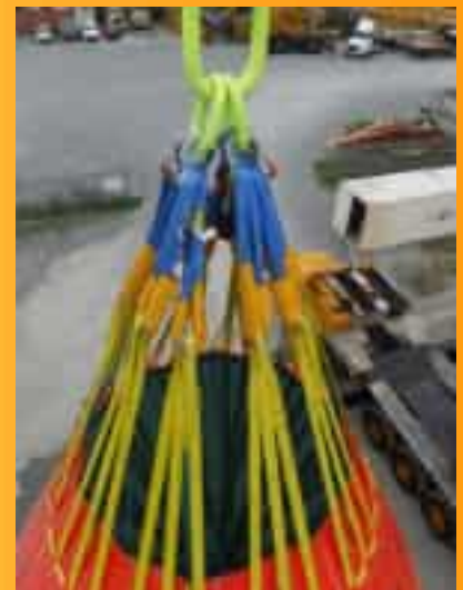
Aerial View at Full Capacity