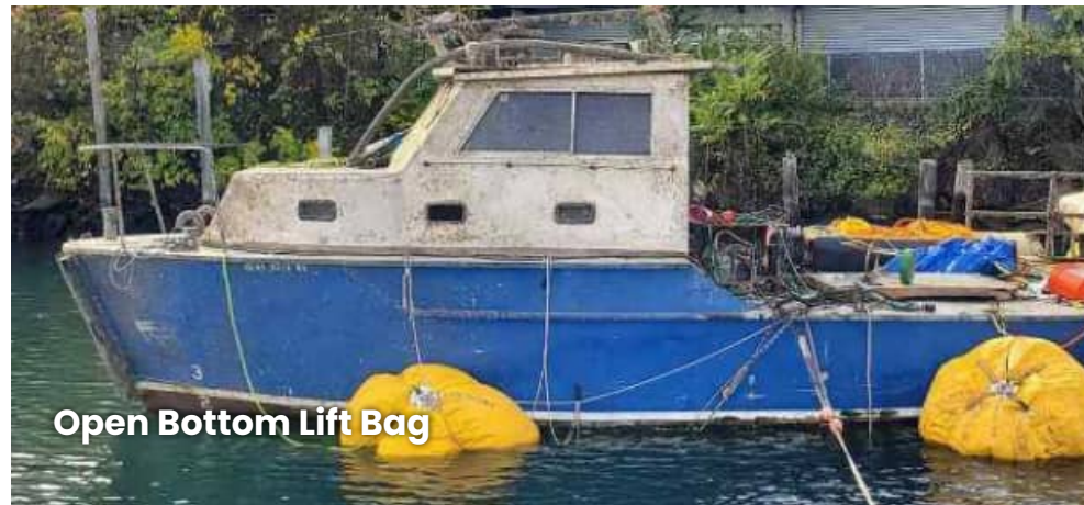
Open Bottom Lift Bag