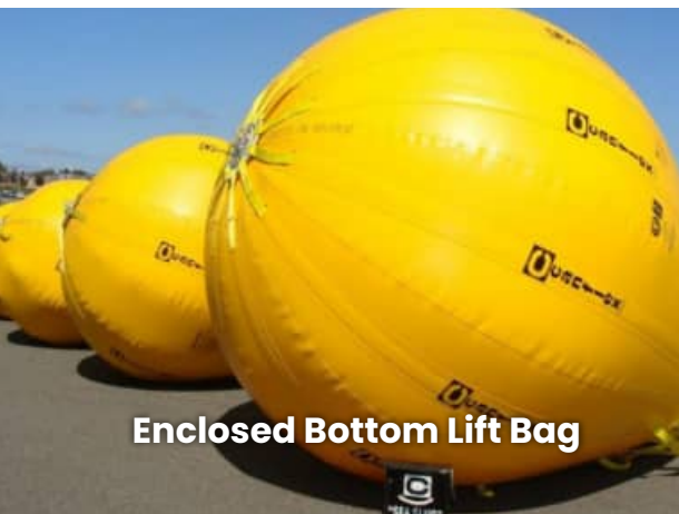
Enclosed Bottom Lift Bag