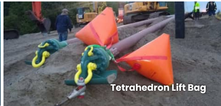
Tetrahedron Lift Bag