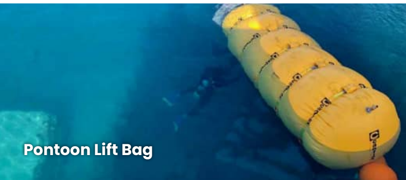
Pontoon Lift Bag