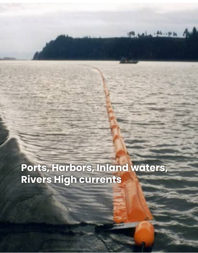
Ports, Harbors, Inland waters, Rivers High currents