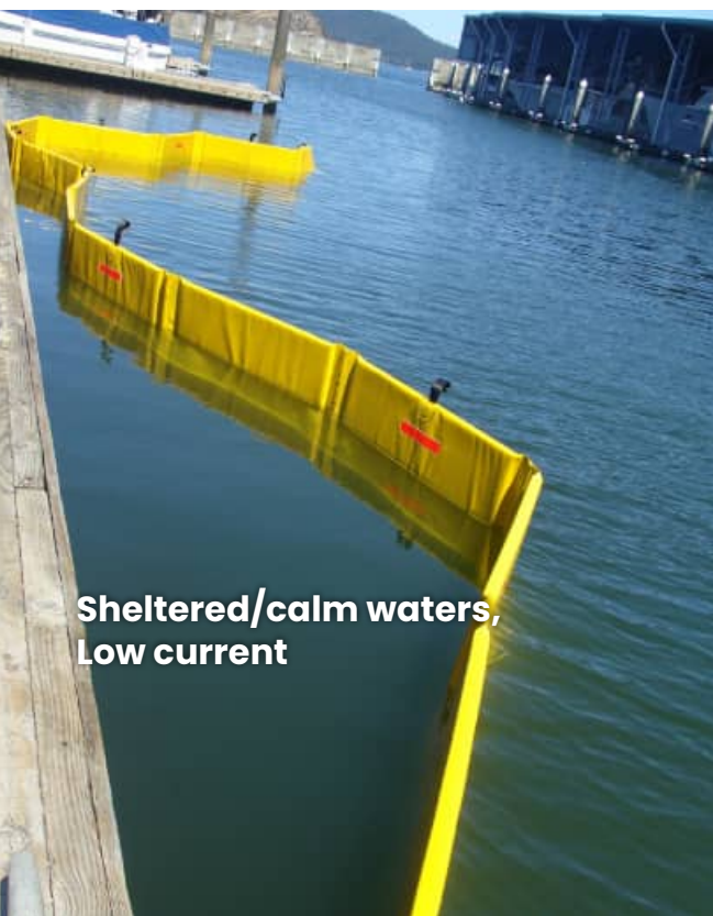
Sheltered/calm waters, Low current