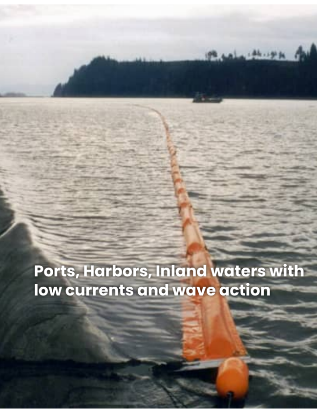
Ports, Harbors, Inland waters with low currents and wave action