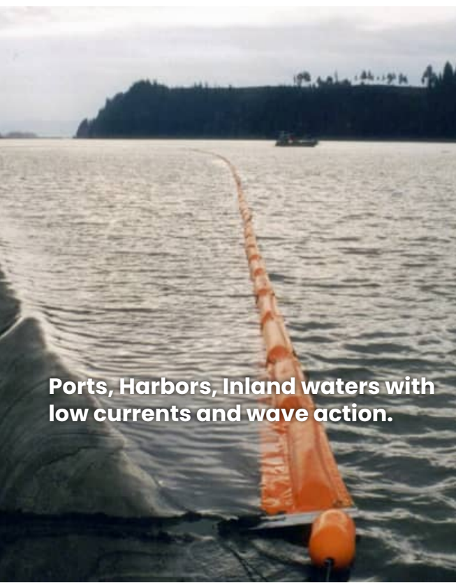
Ports, Harbors, Inland waters with low currents and wave action.