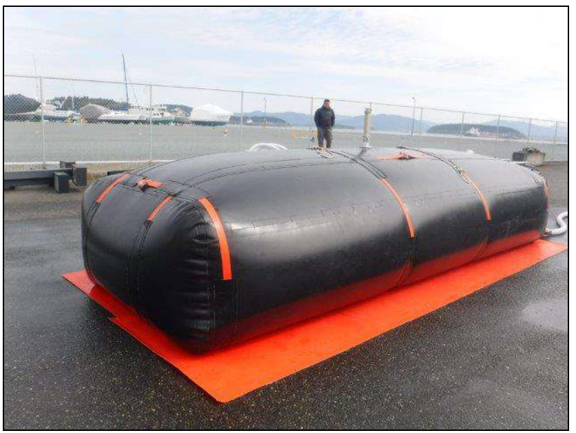
CRT-4000 Canflex Rectangular Tank- 4,000 gal