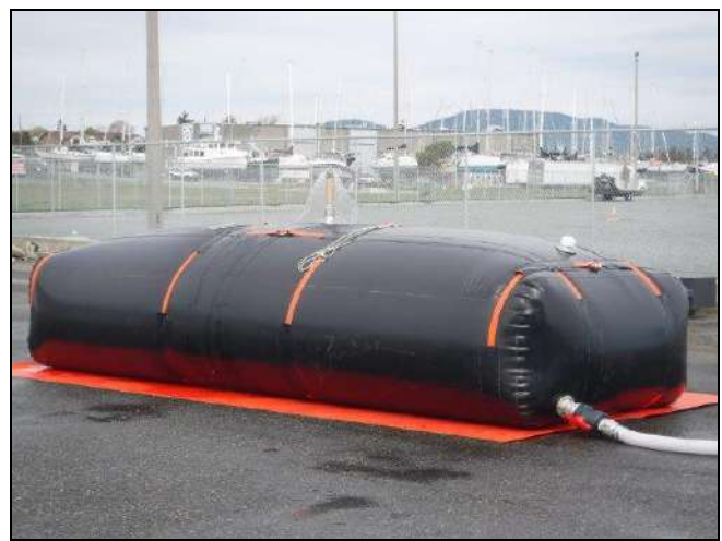
CRT-4000 Canflex Rectangular Tank